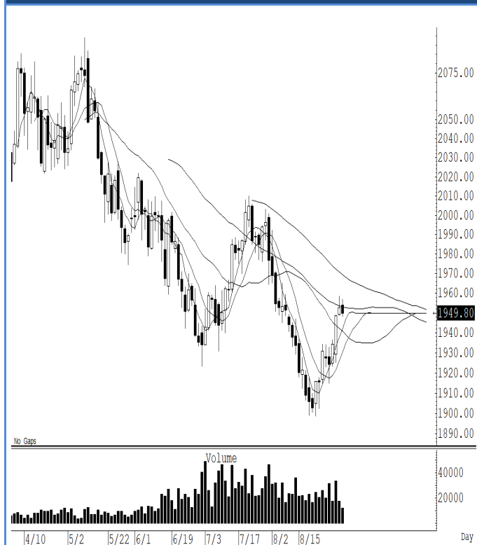
GOU23 (Close 1,949.80 Chg -3.00)

ราคาทองคำโลกแกว่งออกด้านข้าง แนะนำนายการตั้งสูงหรือตั้ง stop ไร่หรือแนะนำ trading ในกรอบ 1,937-1,970 ดอลลาร์ ระวังกำไร แต่ถ้าในกรณีที่ปิดต่ำกว่าระดับ 1,936 ดอลลาร์ แนะนำ ถือ short ระวังผลปรับตัวลงไปแถว ๆ 1,890 ดอลลาร์ ระวังกำไร