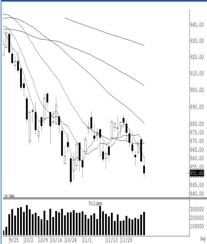
S50Z23 (Close 851.60 Chg -6.80)