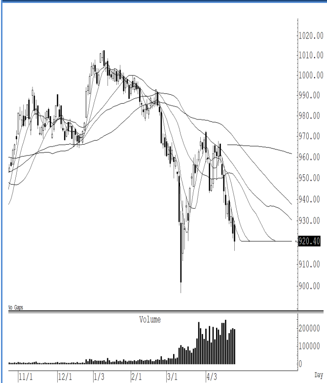
S50M23 (Close 920.40 Chg -3.70)