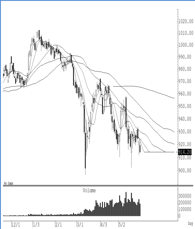
S50M23 (Close 914.20 Chg -7.50)