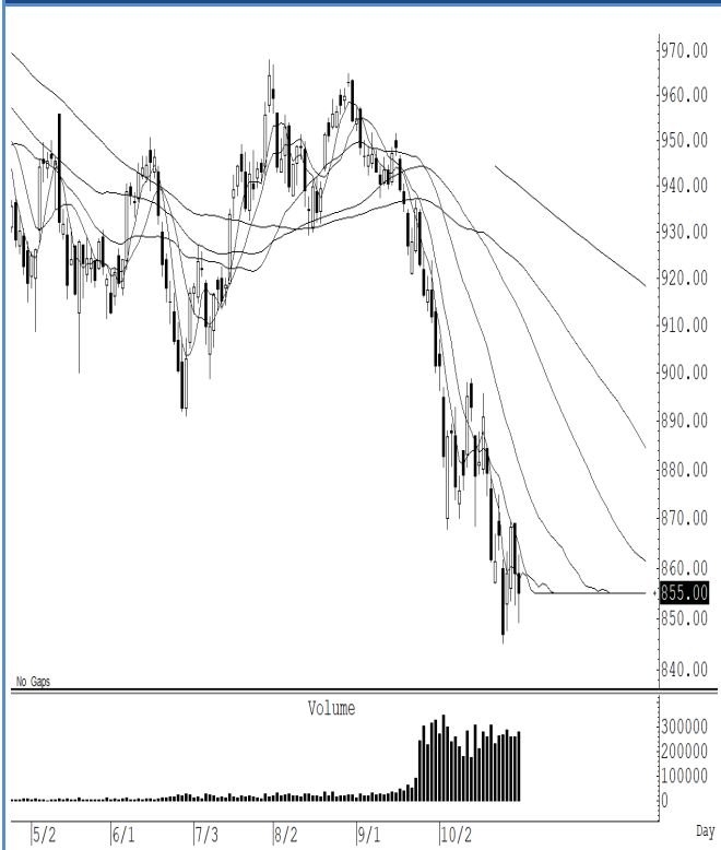
S50Z23 (Close 855.00 Chg -4.0)