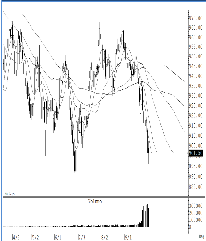
S50Z23 (Close 901.50 Chg -0.10)