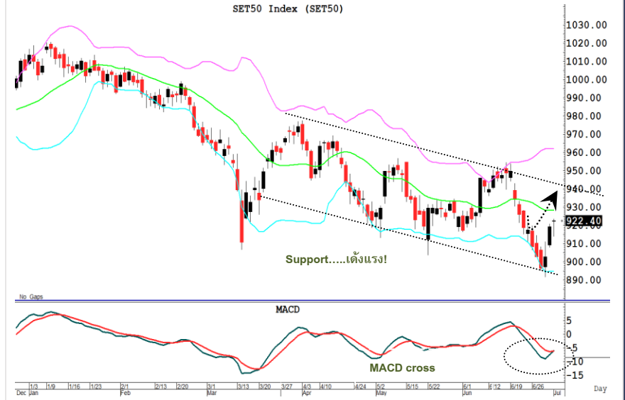
SET50 Index Future

Note: เงื่อนไขผิดทางกรณีขาดทุนมากกว่า 10% ของพอร์ต และปิดสถานะ หรือ ไม่ควรหลุด low ต่ำกว่า 910 จุด