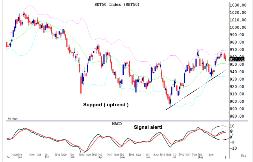
SET50 Index Future

Note: เงื่อนไขผิดทางกรณีขาดทุนมากกว่า 10% ของพอร์ต เนอะปิดสถานะ