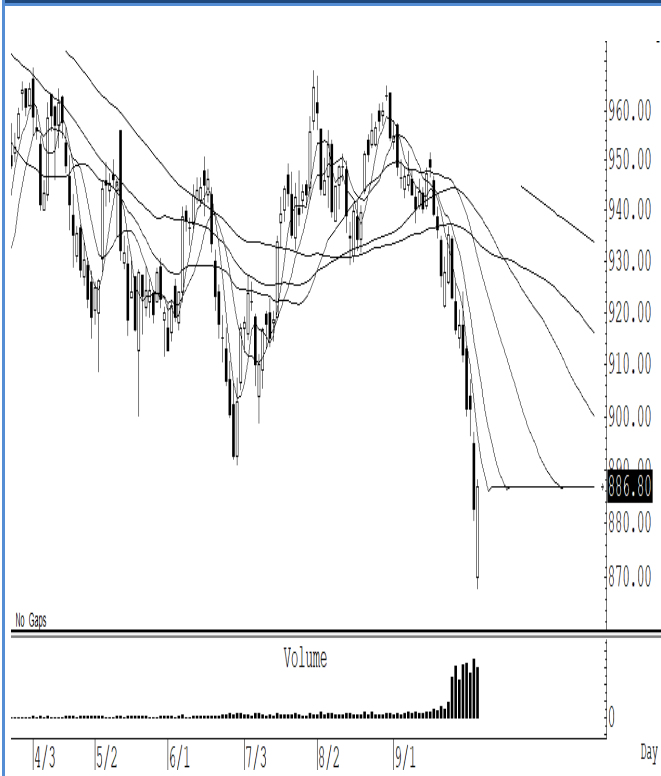
S50Z23 (Close 886.80 Chg 4.10)