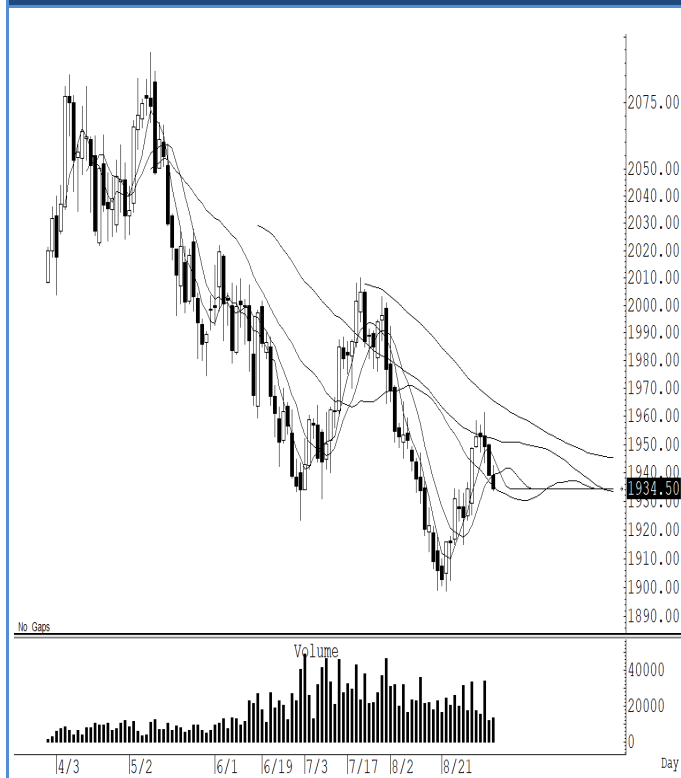
GOU23 (Close 1,934.50 Chg -1.40)

ราคาทองคำโลกปรับตัวลงมาต่อเนื่อง เราแนะนำยกการ์ดสูงหรือตั้ง stop ไวหรือแนะนำ trading ในกรอบ 1,945-1,920 ดอลลาร์ รั้รู้ก้าไร แต่ถ้าในกรณีนี้ที่ปิดต่ำกว่าระดับ 1,919 ดอลลาร์ แนะนำ ถือ short หวังผลปรับตัวลงไปแถว ๆ 1,890 ดอลลาร์ รั้รู้ก้าไร