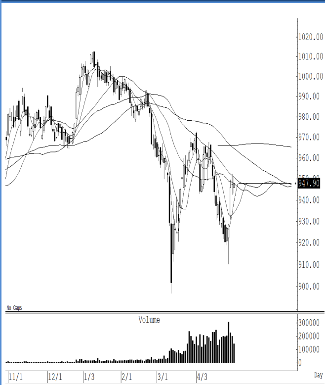
S50M23 (Close 947.90 Chg 0.50)