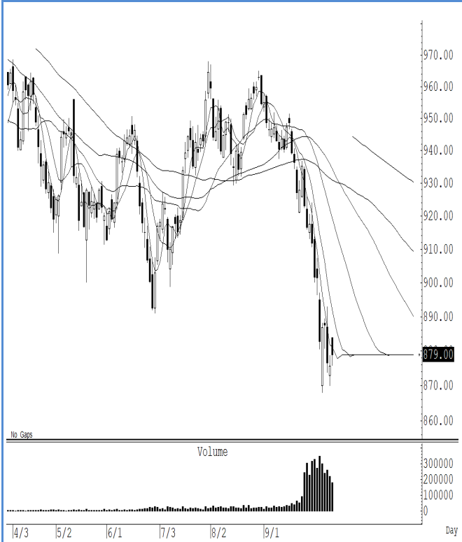
S50Z23 (Close 879.00 Chg 3.40)