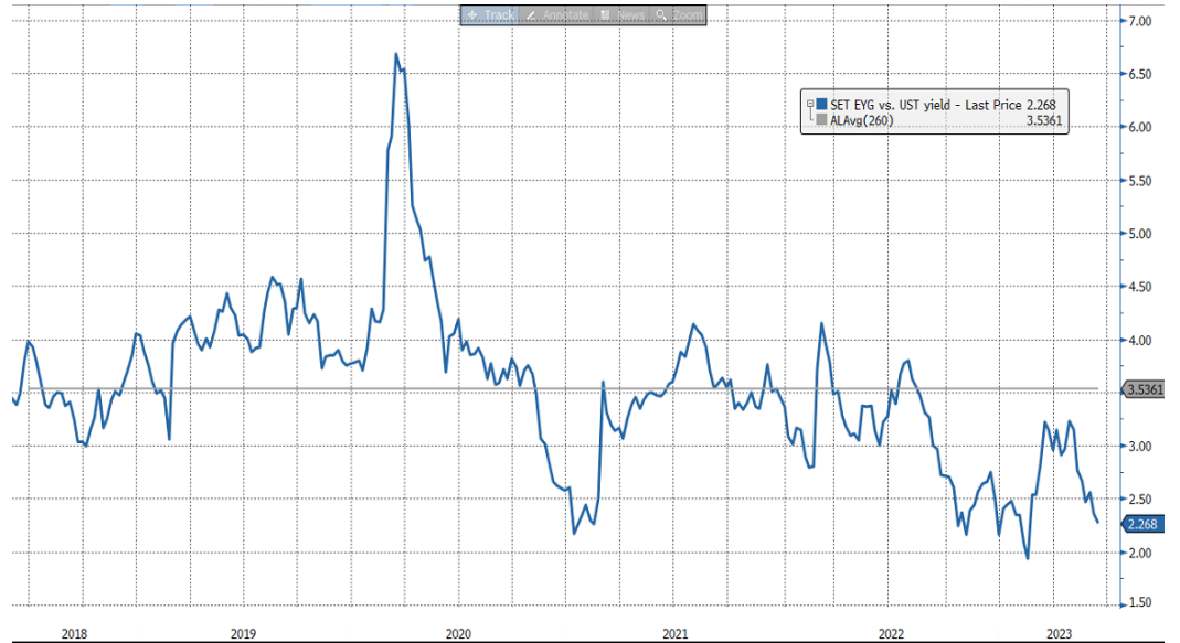
รูปที่ 1: Earning yield gap (EYG) ของตลาดหุ้นไทยอยู่ต่ำที่สุดนับตั้งแต่วันที่ 17 ก.พ.