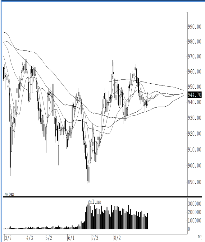
S50U23 (Close 944.70 Chg 6.80)