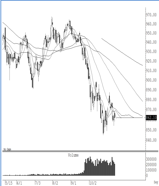
S50Z23 (Close 862.10 Chg 0.70)