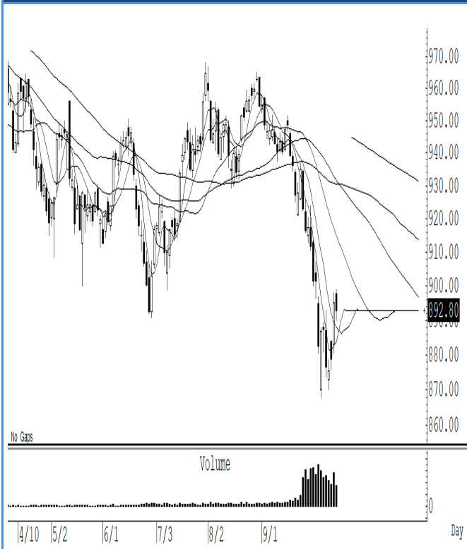
S50Z23 (Close 892.80 Chg -2.30)

กลับมาปิดต่ำกว่าระดับ 895 จุดเล็กน้อย ทิศทางคาดว่าน่าจะแกว่งออกด้านข้าง สั้น ๆ ตีกลับไม่ข้ามแถว ๆ 895 จุด แนะนำ trading ในกรอบระหว่าง 895-880 จุด ระวังกำไร