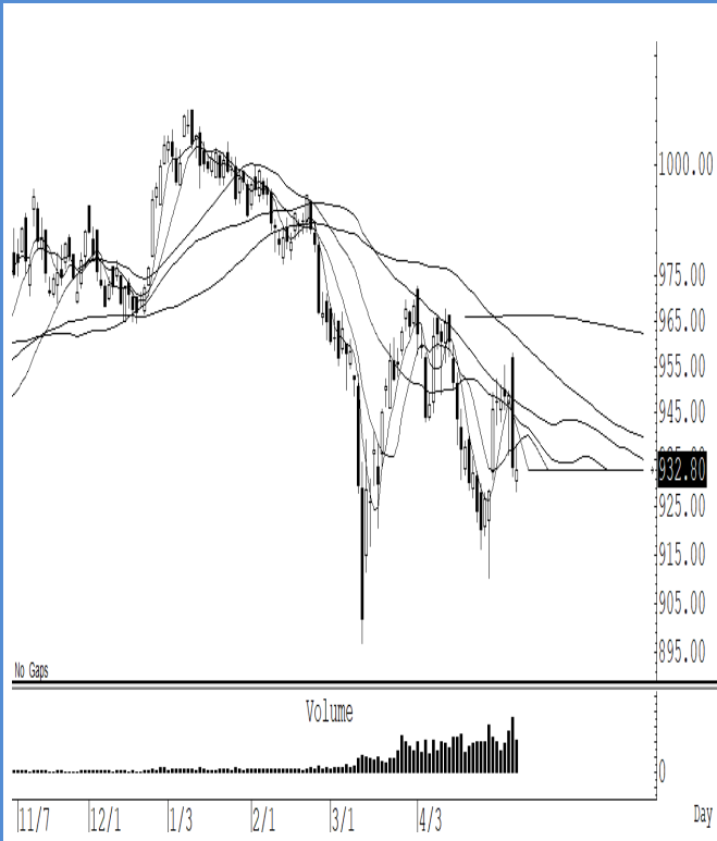
S50M23 (Close 932.80 Chg -0.70)