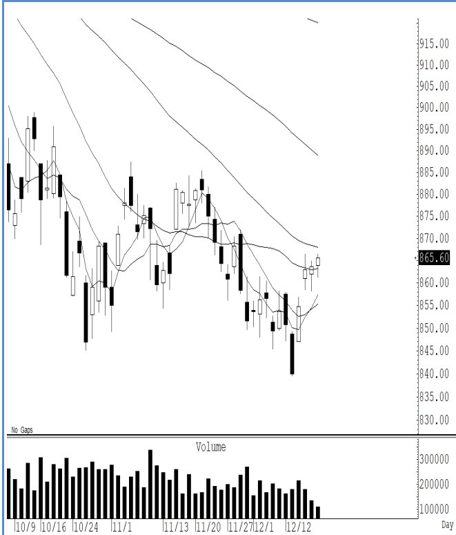
S50Z23 (Close 865.60 Chg 2.0)