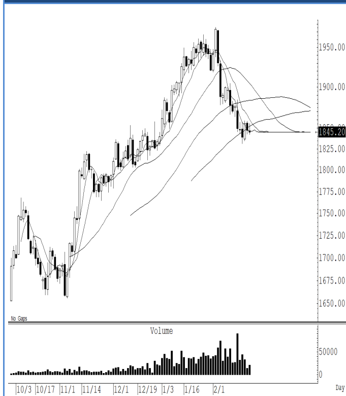
GOH23 (Close 1,845.20 Chg -2.10)

ราคาทองคำแกว่งแคบ เราแนะนำยกการ์ดสูงหรือตั้ง stop ไว หรือถ้ายังไม่มี จุดต่ำใหม่ แนะนำเล่นข้าง long แนะนำ trading ในกรอบ 1,830-1,860 ดอลลาร์ รับรู้กำไร แต่ถ้าในกรณีนี้ที่ปิดต่ำกว่าระดับ 1,825 ดอลลาร์ แนะนำ ถือ short หวังผลปรับตัวลงไปแถว ๆ 1,775 ดอลลาร์ รับรู้กำไร