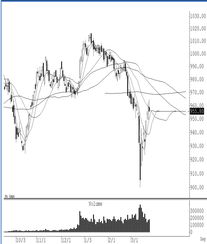
S50H23 (Close 955.80 Chg -3.30)