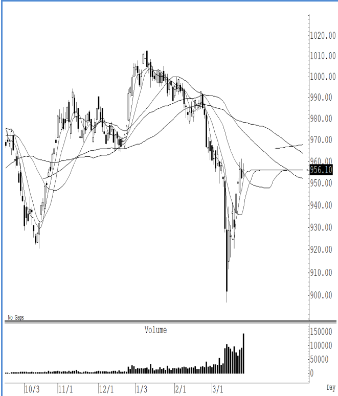
S50M23 (Close 956.10 Chg 4.40)