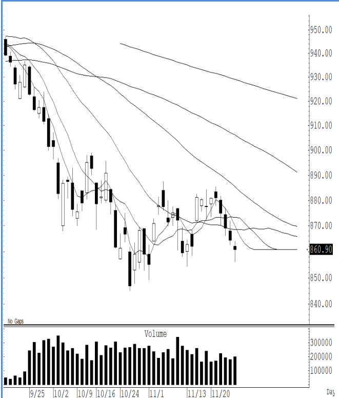
S50Z23 (Close 860.90 Chg 4.50)