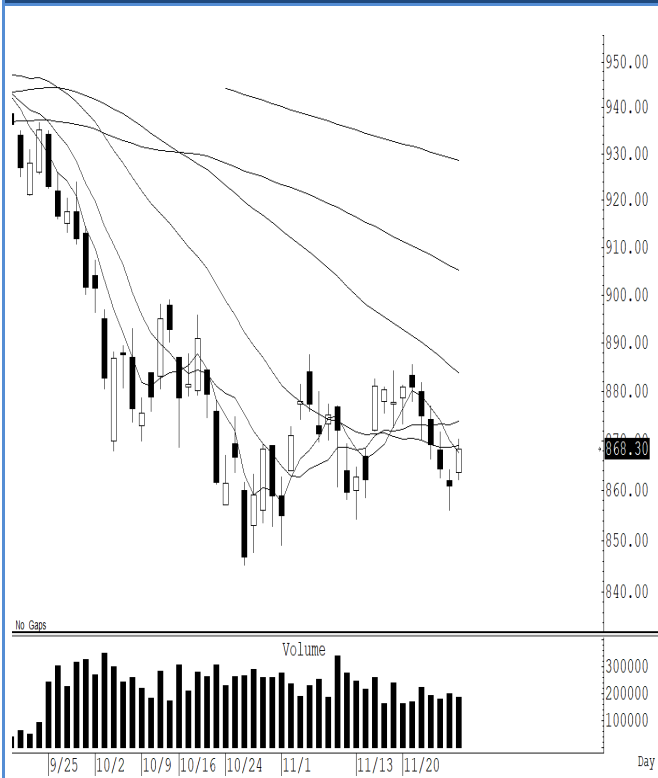
S50Z23 (Close 866.30 Chg 4.50)