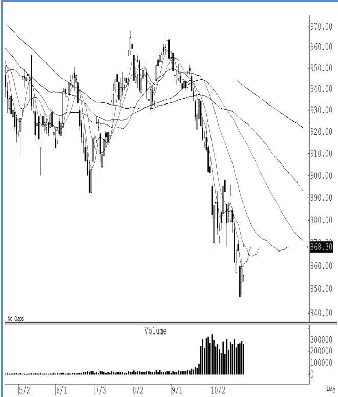
S50Z23 (Close 868.30 Chg 9.20)